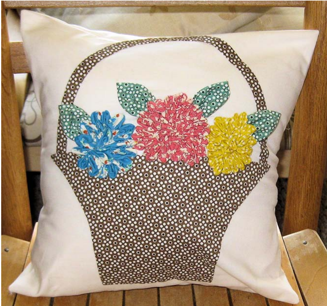
Merci Bouquet – Basket of Blessings Pillow