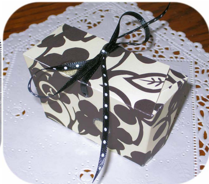
Trapezoid Box (holds 2 truffles)