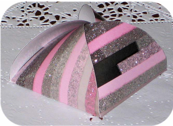
Bon-Bon Box (holds 1 truffle)